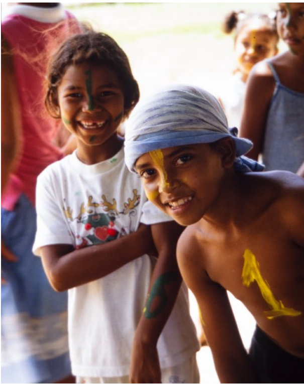
Waro children of the Orinoco Delta