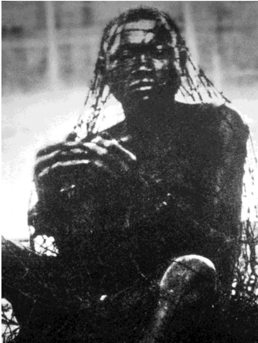
circa 1860

The myth of the USA as a singular beacon of freedom is so pleasing to hear and believe - and our institutions are so eager to repeat it - that it endures in spite of the obvious contradictions. Similar myths are believed by the peoples of all cultures. The willingness of any society to believe its cultural myths can be considered a form of cultural hypnosis. People under the spell – almost everyone, everywhere – are at least partly detached from objective social reality. Although these cultural myths and half truths are part of the glue that holds society together, they can also hold a society back. If members of a culture raise serious questions about the truthfulness of our cherished myths, they will likely find themselves facing social disapproval. Nevertheless, thoughtful criticism helps societies advance past previous mistakes to build a better future. Viewed that way, it is very patriotic.