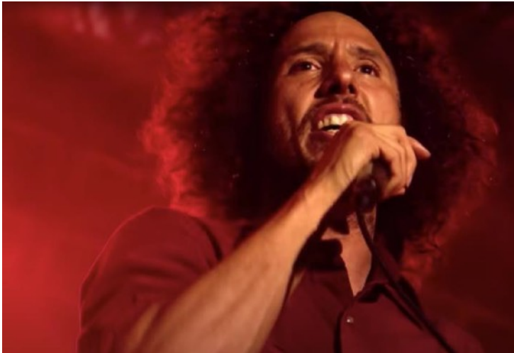
FIGURE 2.2: EXAMPLES OF PROTEST MUSICIANS SINCE YEAR 2000