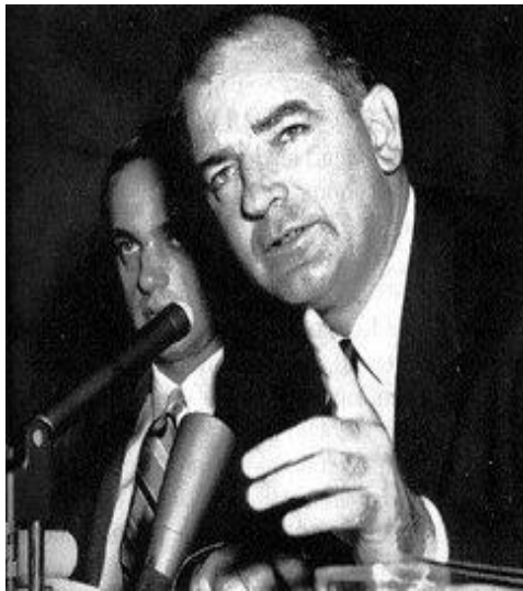
Senator Joseph McCarthy

In the 1950s, ultra-conservative Senator Joseph McCarthy took over the investigation, forcing dozens of citizens to inform on each other, under threat of imprisonment. By 1954, some artists were in prison or had fled the USA for Europe. The critical function they could have provided to guide the country was lost for a decade.