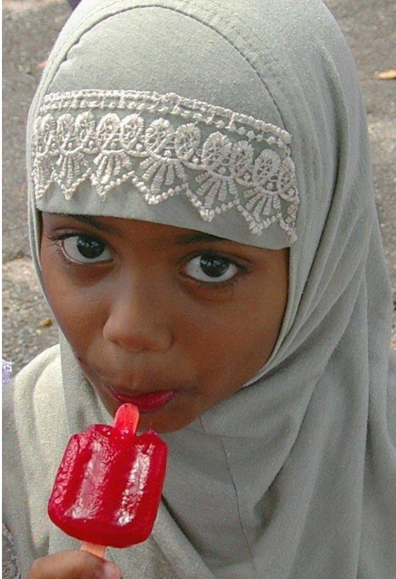
Guyana, 2008

Her African ancestors believed in spirits. Captured as slaves and shipped to South America's Guyana, they were forced by their masters to become Christians. After Guyana won its freedom from Britain, her grandparents - who lived in a community dominated by enslaved Muslims from Pakistan - converted her to Islam. Her religious beliefs were determined by changing cultural factors that surrounded her family. Where did your beliefs originate?