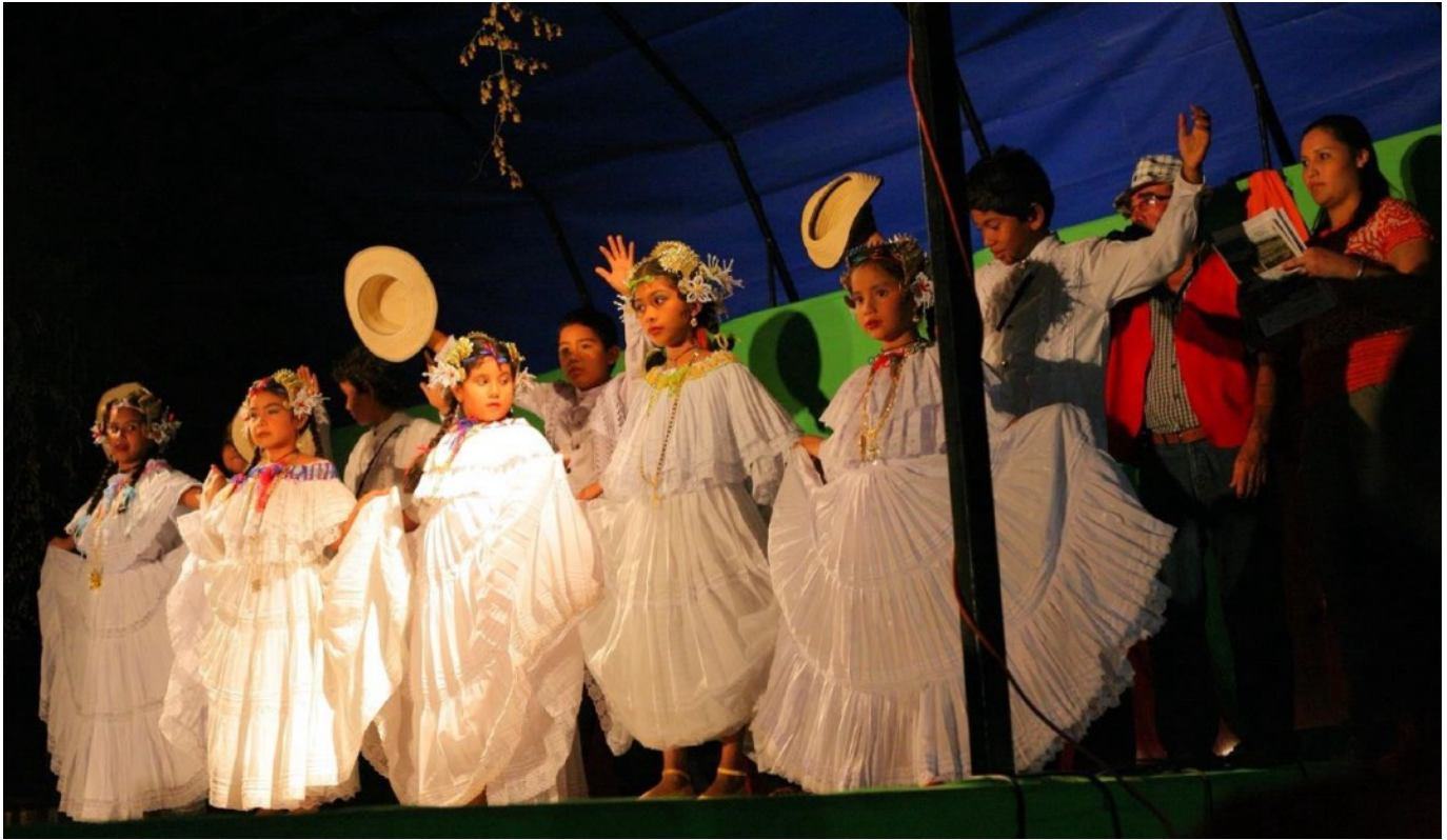
2011, Panama

These Ngobe-Bugle Indian children in western Panama don't normally dress this way. They are learning a dance ritual that helps to cement Spanish cultural influences into their individual minds. By the time they are adults, many of these children may have forgotten their traditional tribal rituals and beliefs. Wealthy Latinos of Spanish descent are just a fraction of the local population, but they dominate this region economically and are able to determine which rituals will be performed at local festivals.